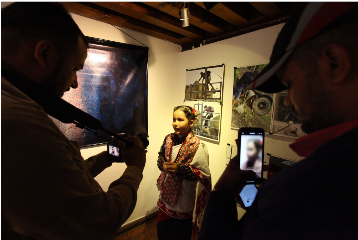
Patan Museum, "Song of Elephants" exhibition, interview with the media. Age 8.