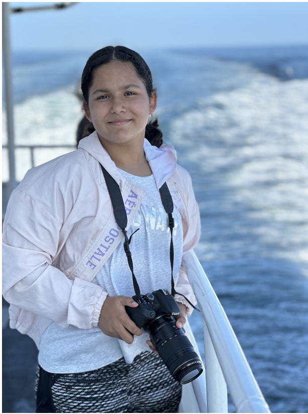
Photographing whales, Cape Cod, age 10.