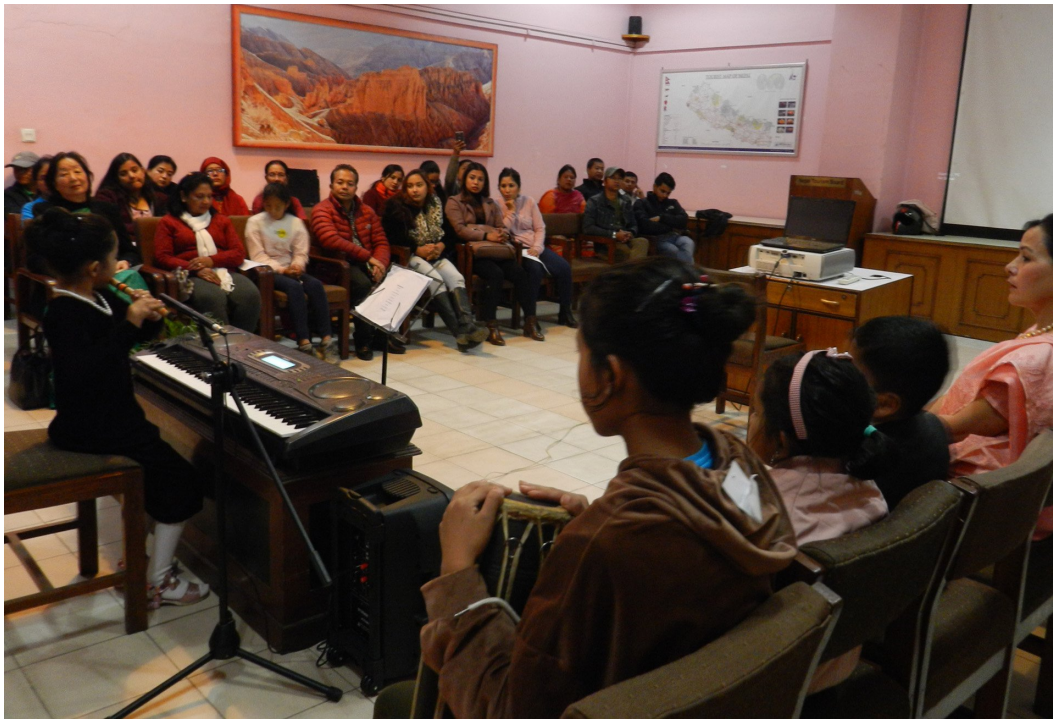
Vidheha's exhibition and performance takes place at the "Nepal Tourism Board" spaces. Age 5.