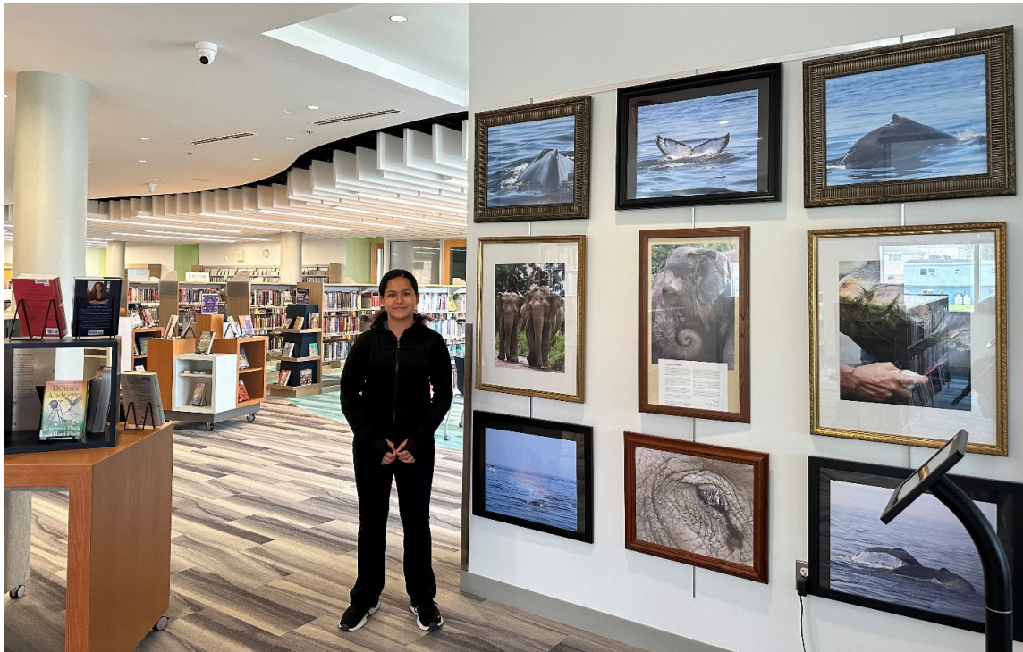
Twin Beaches Library.

Please email pallavranjan@gmail.com for high resolution versions of these images